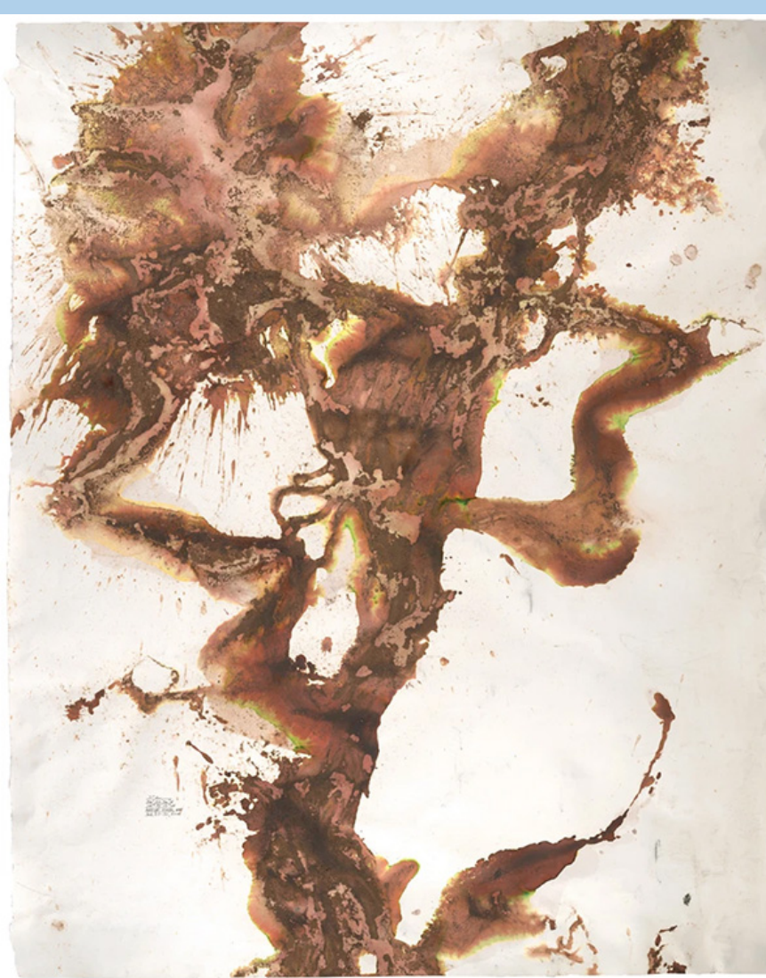
154 Degrees SE

Dirt, dry pigment, ink driven by rain on paper